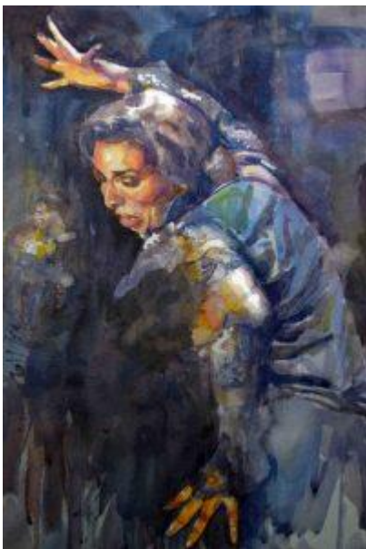
Title: Vuelta Quebrada (Broken Turn)

Included in this press pack are four examples of watercolour paintings currently in Seville for the exhibition.