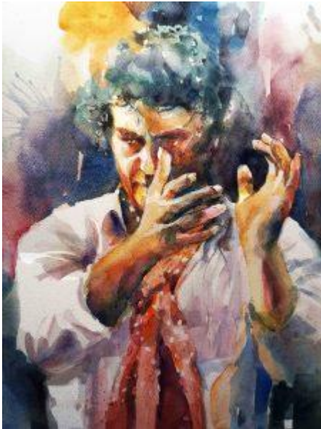
Title: Listening for his entrance

I was struck by the absorption of this dancer and that moment when the body explodes upwards with such emotional power. I like the garment sleeves. They seem to add to the suddenness of the movement.