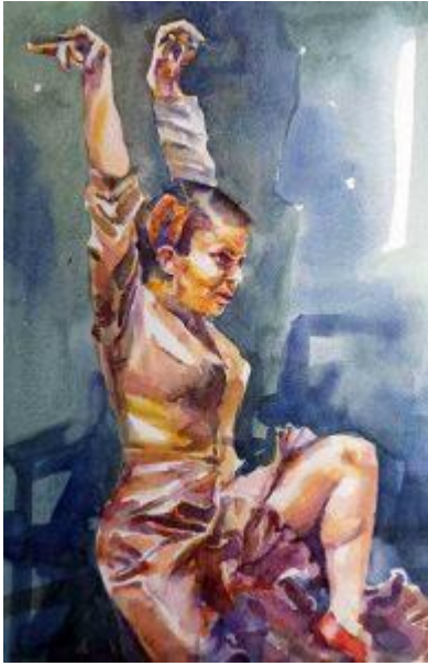
Title: Igniting the Soul